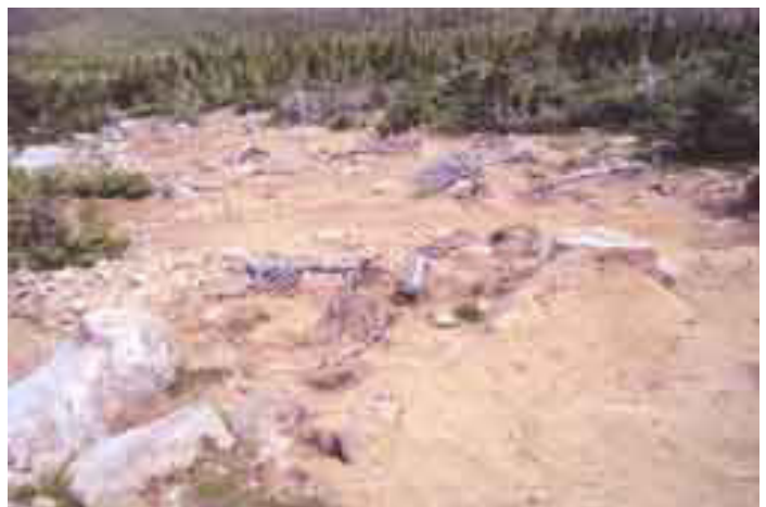
Present steep and eroded trail up Buffalo Mountain.

Trail work will start in early July. The project will build almost 1.5 miles of new trail to replace the very steep, eroded, user-created trail up Buffalo Mountain. The trail will then become part of the USFS trail system. Trail crews will close and revegetate 0.9 mile of the old non-system trail. (cont'd. p. 2)