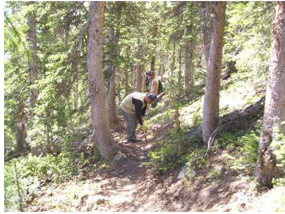
Above: RMYC crew building new trail.