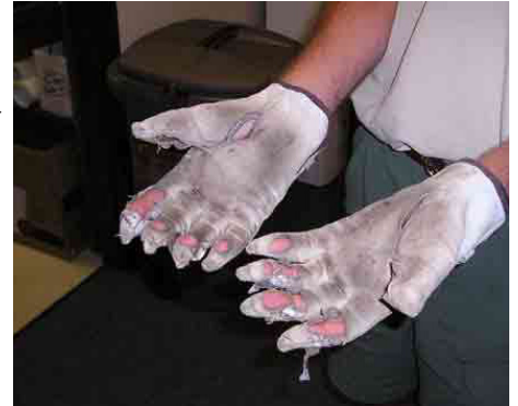
Right: Don's gloves after 8 days.