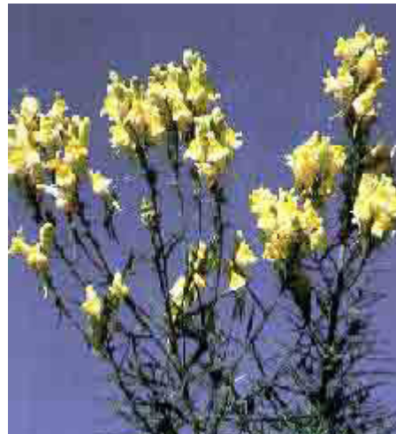
Yellow Toadflax, a noxious weed in Summit County