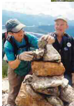
Left: FENW volunteers building cairn after cairn.