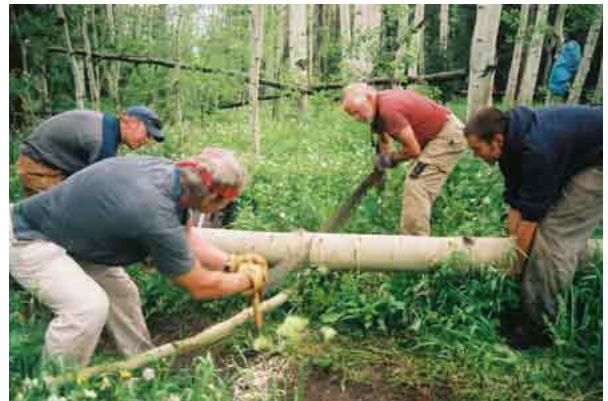
Hearty FENW volunteers clearing trail on the Surprise Lake Trail during the Gateways project in June.

As is traditional with our group, all trail work days were followed by refreshments and snacks. Media coverage was excellent as the Summit Daily News ran several pictures of our volunteers on Buffalo Mountain. All in all this summer yielded very tangible and positive results for Summit County's Wilderness.